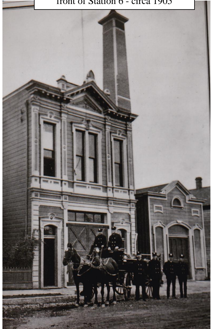
Hose Company 6 and crew stand in front of Station 6 - circa 1905