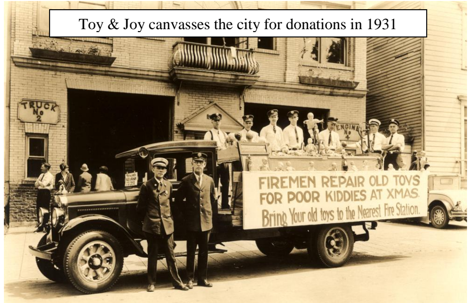
Toy & Joy canvasses the city for donations in 1931

As a totally volunteer effort, Toy & Joy has changed over the years from different fire stations repairing different types of toys (e.g. bikes at one station, dolls at another station, etc.) to the collecting or purchasing of new toys to the distribution of the same toys to over 12,000 children. That equates to 3,000 families, on average, each year.