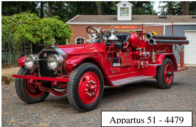
Apparatus 51 - 4479