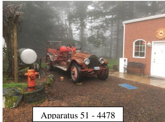
Apparatus 51 - 4478

As was common in Portland's early motorized years, both were converted from their original American LaFrance engines to Hall-Scott engines. 4479 was converted to a Hall-Scott 177 straight 6 cylinder bored out to 1100 cubic inches in the early 1930s. It also received hydraulic front brakes, vacuum brake assist, a generator, and an electric starter. 4478 has yet to be determined.